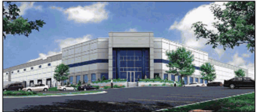
MidPoint Development, AmeriPLEX at the Port, Portage, IN 574,000 sf Spec Building